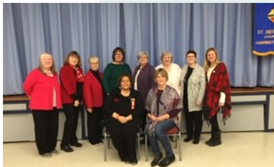
Delaware State Executive Board